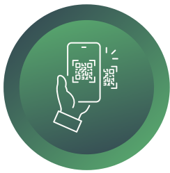
Scan to Pay