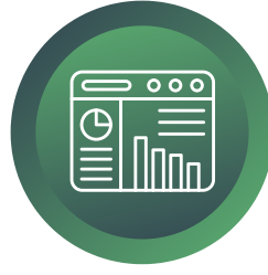
A Powerful Centralized Dashboard