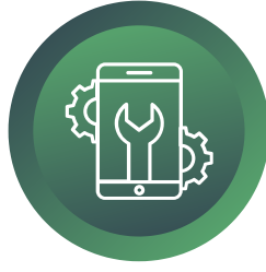
White-labeled Web App