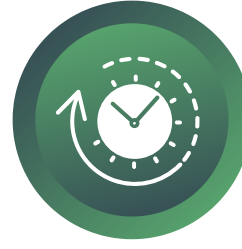
Merchant on Record. Real-time Credits to Your Account